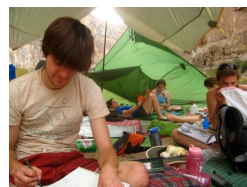
Sketching at the Campsite