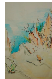
Field Notebook Sketch