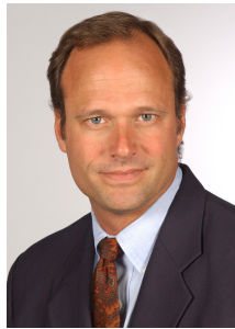
Holcim (US) Professor of Sustainable Enterprise Ross School of Business School of Natural Resources and Environment

Sponsored by: The Student Sustainability Initiative The Graham Environmental Sustainability Institute The Center for Research on Learning and Teaching